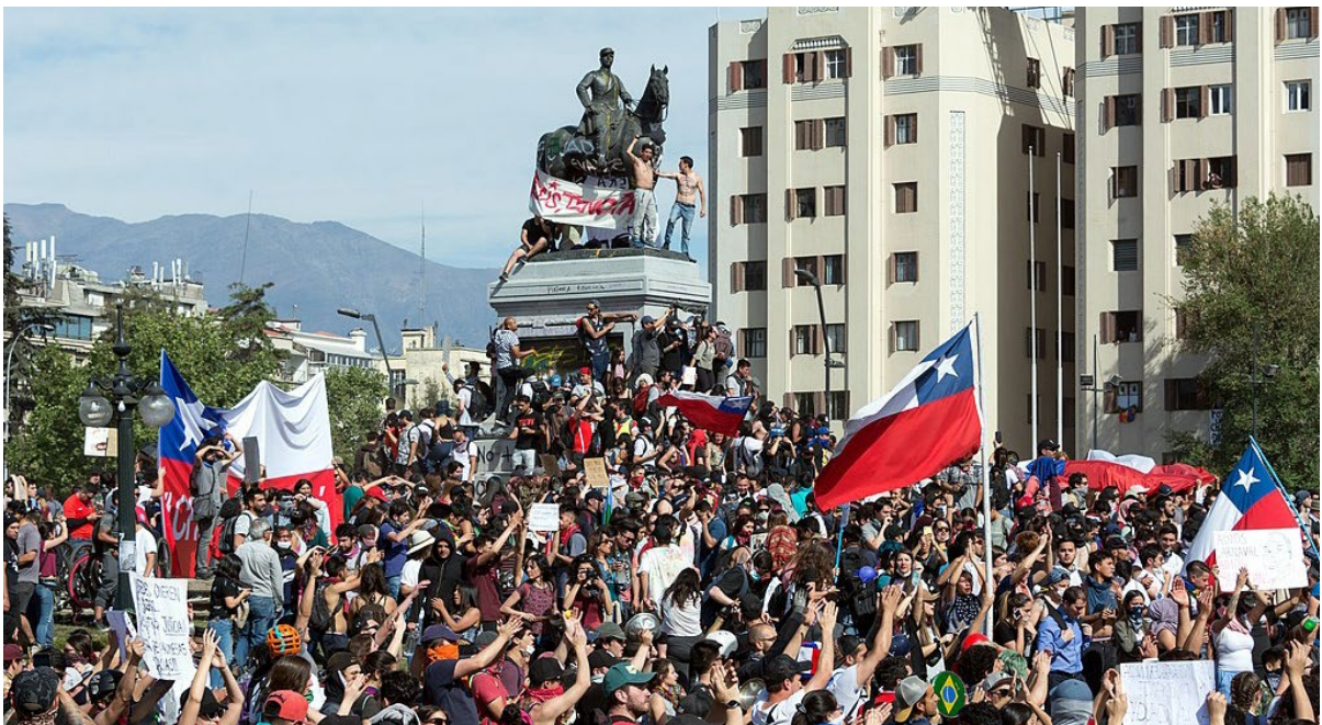
This image of protesters in Chile is used courtesy of Carlos Figueroa.

Ultimately, a sustainable fiscal policy requires positive actions by the State, including the fight against corruption in its broadest sense. At the same time, the implementation of holistic economic programs with sustainable fiscal policies must include: strategic public investment plans to promote industry and reduce inequality disparities; progressive tax systems respecting the principles of horizontal and vertical equity; and regional and international agreements on the fight against evasion, avoidance and fiscal incentives which fail to provide genuine economic benefits to the country and instead erode the tax base.