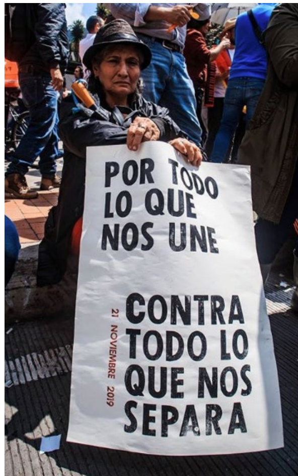
This image of a protester in Bogotá is used courtesy of Christian Sanchez (@ishamp/Instagram).

Reducing social spending should not be seen as a condition that sustains economic reactivation, but as a situation to be avoided at all costs so as not to hinder or delay it. Social spending merits the maximum protection in times of crisis, not only because of the State's obligations but also for strategic reasons. Low investment in social rights perpetuates cycles of poverty and their intergenerational transmission, and the lasting consequences of the child poverty cycle, as well as other detrimental effects, are often linked to serious social conflicts and institutional instability. 92 Spending on rights should not be seen as an expense, but instead as an investment which can both lay the foundations of future prosperity and prevent new crises.