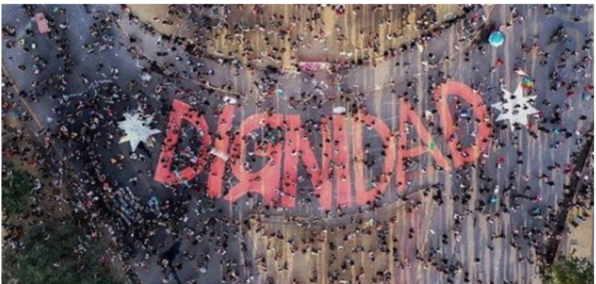
This image of a protest in Chile is used courtesy of @tj_toro9/Instagram.

States and civil society have access to practical instruments to periodically assess the redistributive scope of their country's fiscal policy and its contribution to poverty reduction, in order to undertake reforms that strengthen both aspects. The Diagnostic Questionnaire of the Commitment to Equity (CEQ) project, for example, is a comprehensive methodology aimed at answering the following questions accurately: a) How much redistribution and poverty reduction is being achieved in each country through social spending, subsidies and taxes?, b) How progressive are tax collection and public spending?, c) And within the limits of fiscal prudence, what could be done to increase redistribution and reduce poverty in each country through changes in taxation and spending? 33