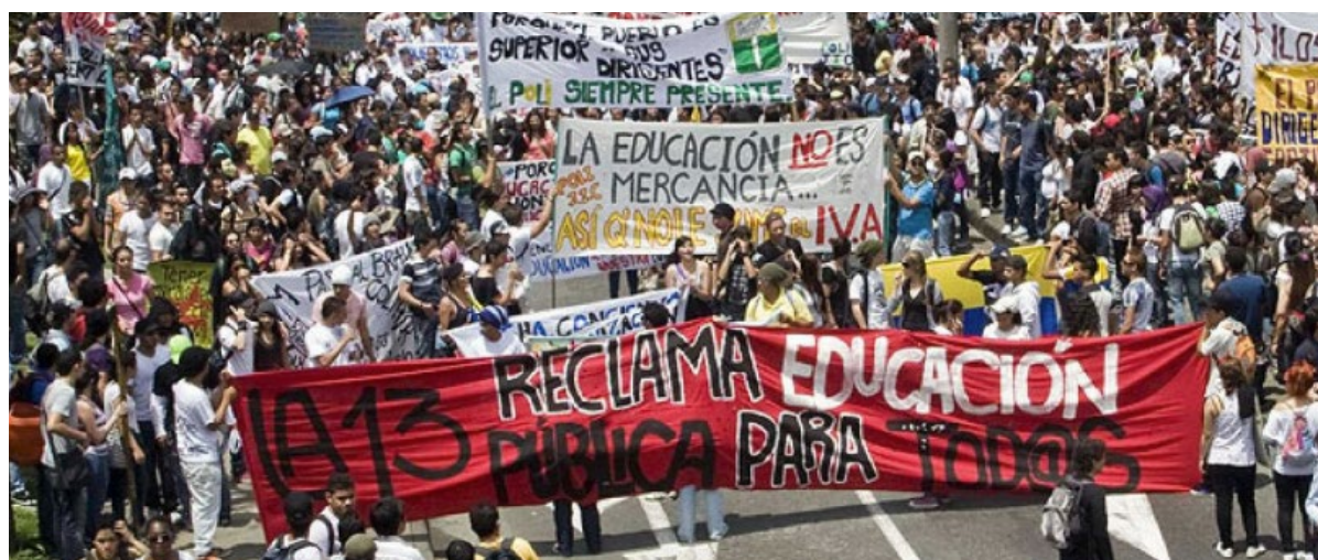
This image of a national strike in Colombia is used courtesy of @DiegoEnLaLucha/Twitter.