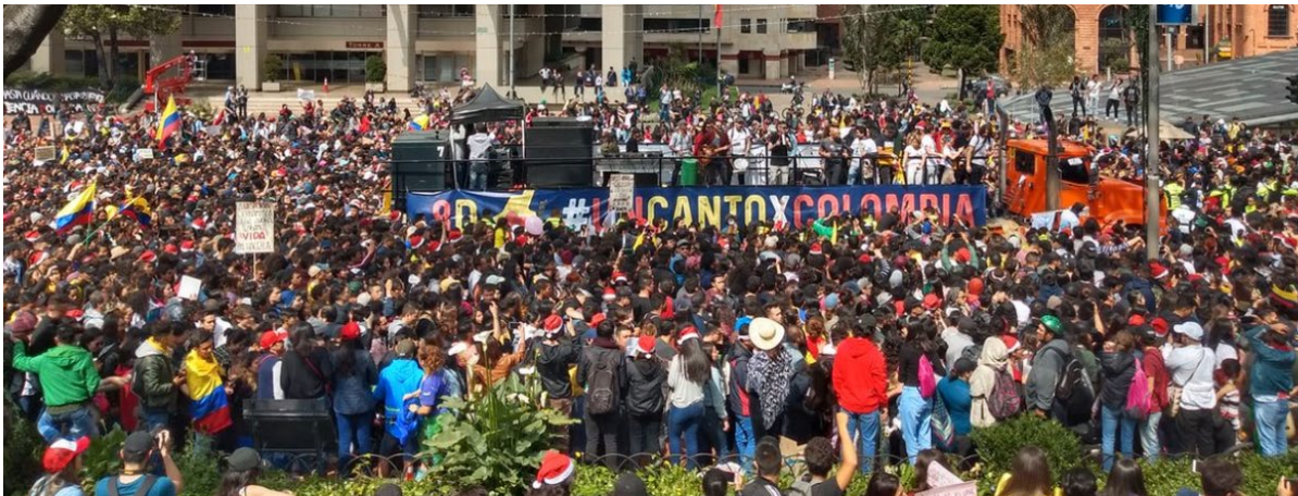
This image of a national strike in Colombia is used courtesy of @mjsarmientoa/Twitter.